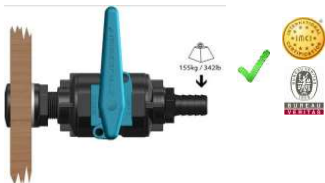
ISO 9093-2 Standard requirements;

In accordance with ISO 9093-2 standards, Skin Fittings (Thru Hulls) are subjected to a 155kg (341.7lb) load, applied to the threaded section for a minimum of 30 seconds, without any damage occurring. TruDesign Skin Fittings (Thru Hulls) meet this standard. Note – See overhang instructions below to ensure compliance.