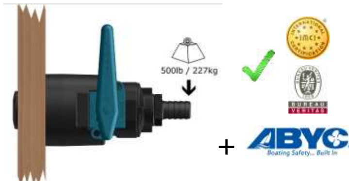
ABYC H-27 Standard requirements;

Skin Fittings (Thru Hulls), when assembled together with TruDesign Ball Valves and Load Bearing Collars, will comply with ABYC H-27 standards. This allows the entire assembly to withstand a 500lb (226.8kg) load applied to the inboard end of the assembly for a minimum of 30 seconds without any damage occurring.